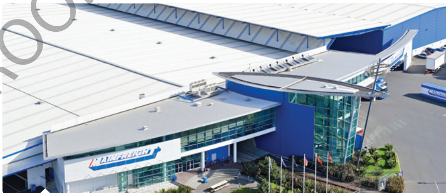
TOPGLASS® COLOUR: OPAL PROFILE: MAXISPAN® 2400 G/M 2

*Refer to the Alsynite Technical catalogue for full warranty information.